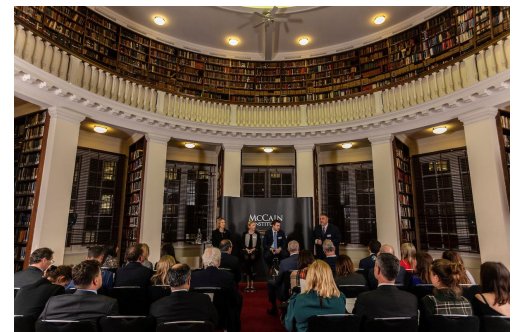
Fellows engage in a conversation on the importance of future collaboration across the Five Eyes partner nations.