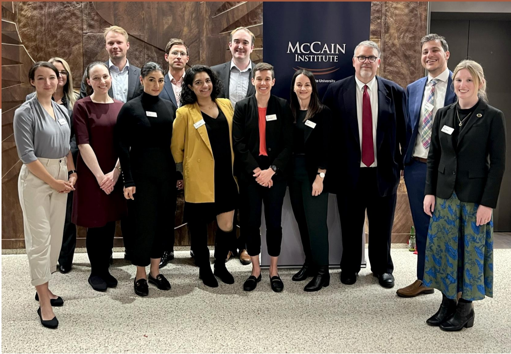
The 2023 fellows attend a welcome reception with alumni and embassy representatives at the McCain Institute in Washington, D.C.