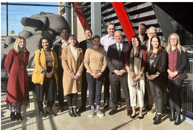
Fellows explore the International Spy Museum