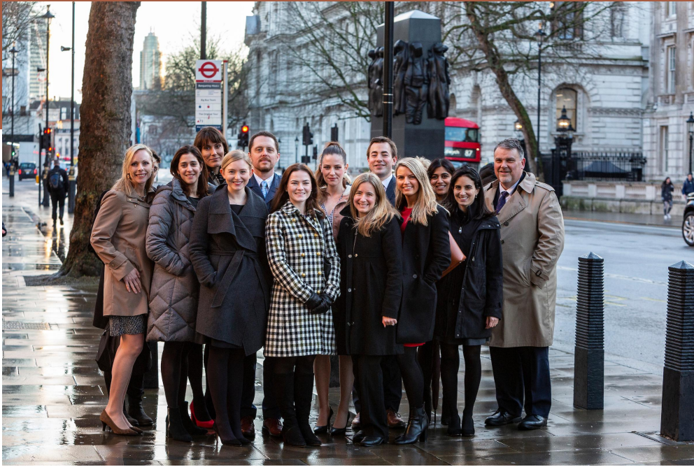
The 2019-20 fellows in Central London.