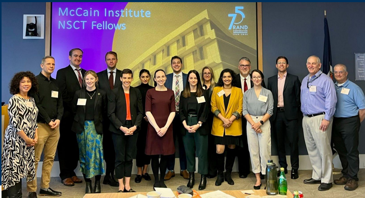
The 2023 fellows participate in "Hedgemony: A Game of Strategic Choices," at RAND Corp. in Washington, D.C.

The McCain Institute National Security & Counterterrorism Fellowship program invests in young women and men of extraordinary achievement and promise who – in the mold of Senator John McCain – have demonstrated their commitment to national security and public service.